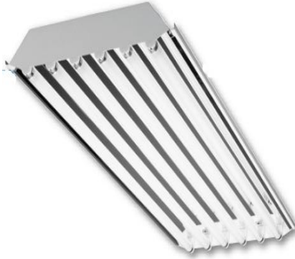
FRONT WITH WIRE GUARD

Mainly used for indoor lighting of grocery stores, warehouses, fabrication facilities, assembly plants, etc.